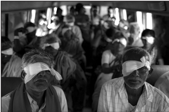
Patients of Aravind After Their Surgeries, Waiting Aboard the Bus That Will Take Them Home