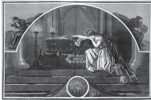
This 1865 engraving by Thomas Nast was created in response to the assassination of President Abraham Lincoln.