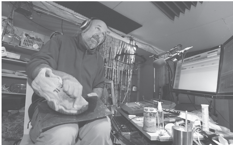
A Foley Artist Making Sounds with a Shoe