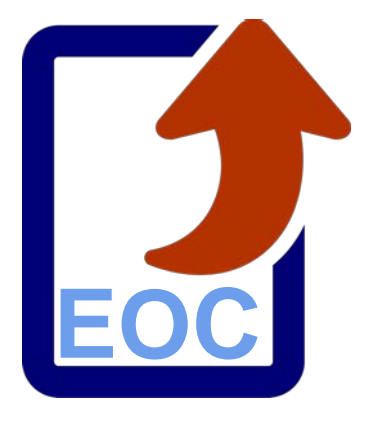
End of Course scores increased 3% while the overall district scores showed no change