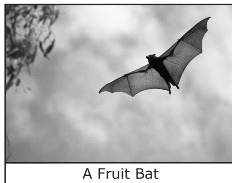
A Fruit Bat