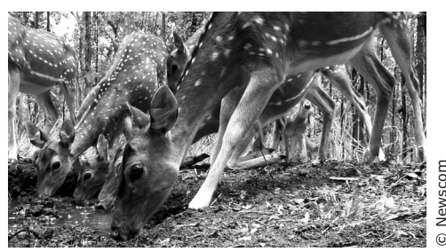
Real Images Captured by Elephant Cameras

(24) "This sort of thing hasn't been done before," Downer later commented.(25) "But now," he added, "It seems the most natural thing in the world."