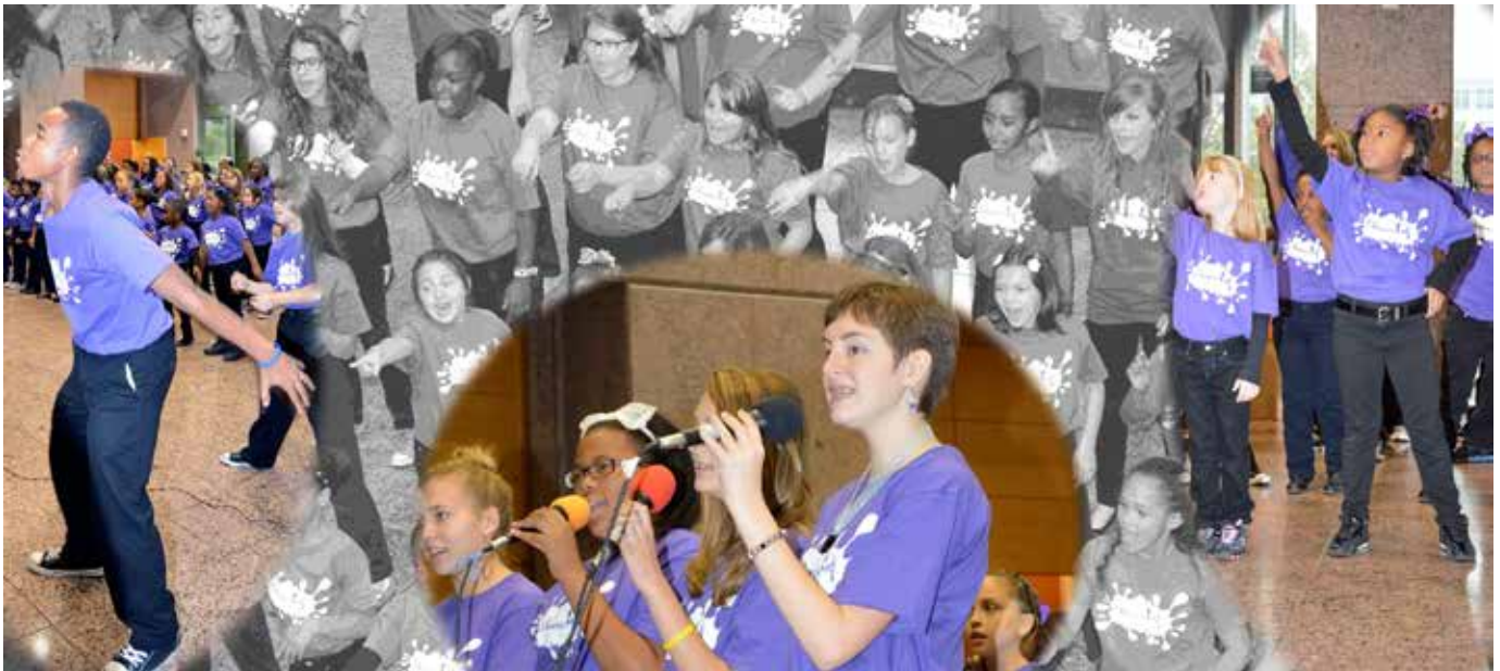
Members of the Village Tech Schools Character Chorus from Cedar Hill, Texas performed at the SBOE meeting in November 2013.

Texas Education Today may be found online at www.tea.state.tx.us/tet/