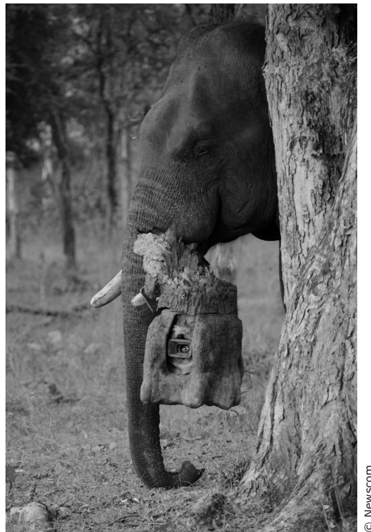
An Elephant with a Trunk-Cam