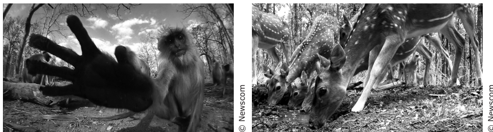
Real Images Captured by Elephant Cameras

(20) Clearly, the jungle animals were not afraid of the elephant cameras. (21) As a result, the elephants were able to film creatures that are often leery of people. (22) Curious monkeys reached out for the tusk-cams deer stood still and allowed the cameras to film them. (23) Jungle mothers let the elephants get very close to their babies.