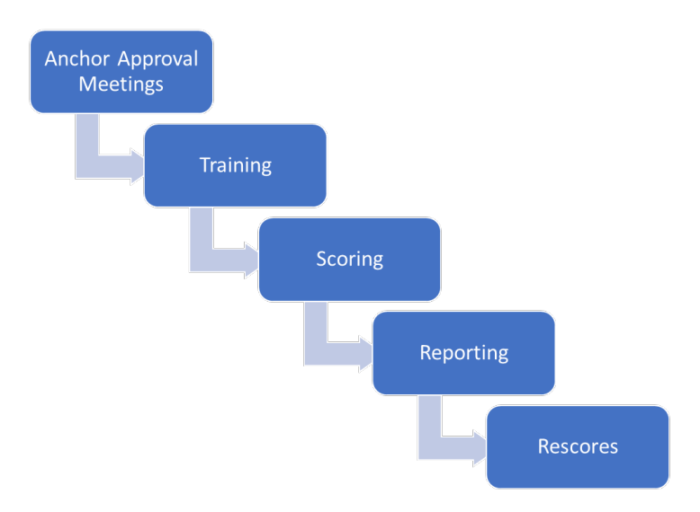
Step 1: Anchor Approval Meeting

The steps outlined below each have an important role in the overall scoring process.