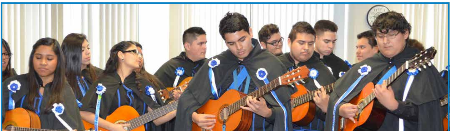
Estudiantina Tenampa, a mariachi group from Porter High School in the Brownsville Independent School District, entertained during the SBOE swearing-in ceremony at the February 2015 meeting.

The 2014-2015 accreditation status for each school district and charter school can be found on the Texas Education Agency website at www.tea.state.tx.us/accredstatus/ .